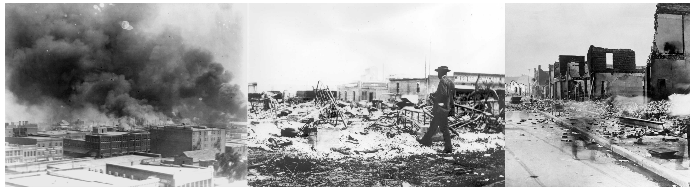
In 2001, the Oklahoma Commission to Study the Tulsa Race Riot of 1921 concluded that between 100 and 300 people were killed and nearly 10,000 people made homeless.