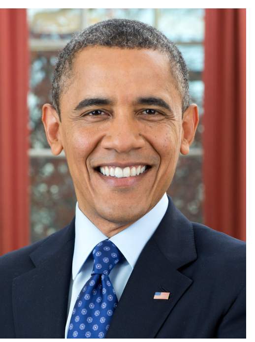
Barack Obama, official presidential portrait, 2012.

first African American President of the United States, was born in Honolulu, Hawaii, 1961.