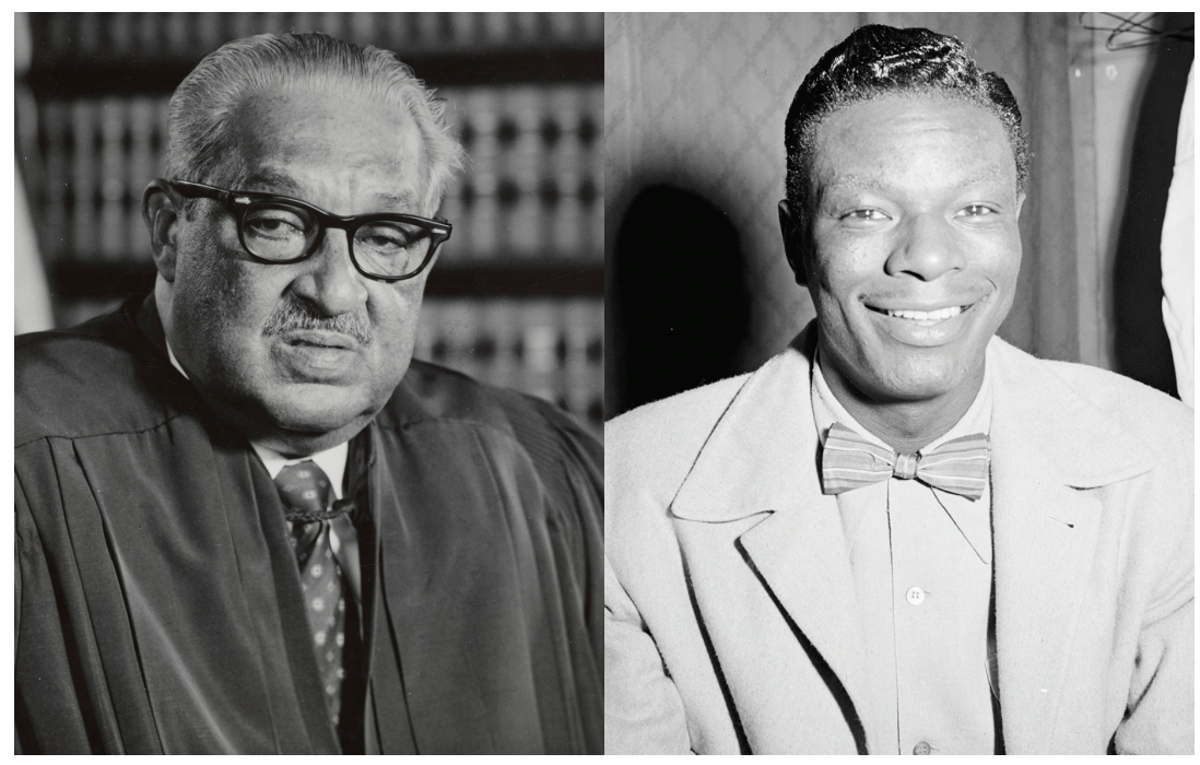
Thurgood Marshall, official Supreme Court portrait, 1976; Nat King Cole hosted a variety show on NBC from 1956 to 1957, but the show was cancelled for lack of a sponsor.

of the Army, was born in New York City, 1933.