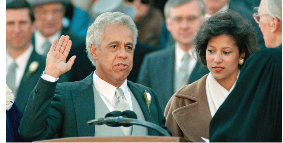
Douglas Wilder, the first popularly-elected African American to hold a U.S. state's highest office, being sworn in as governor of Virginia, January 13, 1990, outside the state capitol in Richmond.