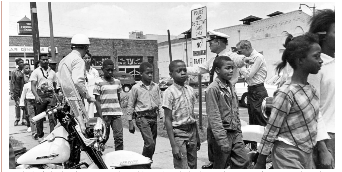
Hundreds of school students in Birmingham, Alabama skipped school to march in protest of segregation during the Birmingham civil rights campaign, May 2–5, 1963.

baseball player of the modern era, 1947.