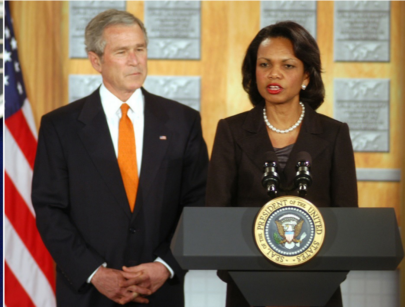
President George W. Bush and US Secretary of State Condoleezza Rice, c. 2006.

Condoleezza Rice, diplomat, scholar and author spent much of her childhood in Birmingham's Titusville neighborhood. Her father was pastor of Wesminster Presbyterian Church. Today, Rice is the Denning Professor in Global Business and the Economy at the Stanford Graduate School of Business; the Thomas and Barbara Stephenson Senior Fellow on Public Policy at the Hoover Institution; and a professor of Political Science at Stanford University. She is also a founding partner of RiceHadleyGates, LLC.