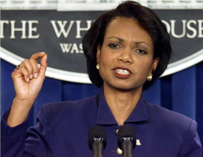
US National Security Advisor Condoleezza Rice speaks to reporters at the White House, Washington, DC., November 2001.