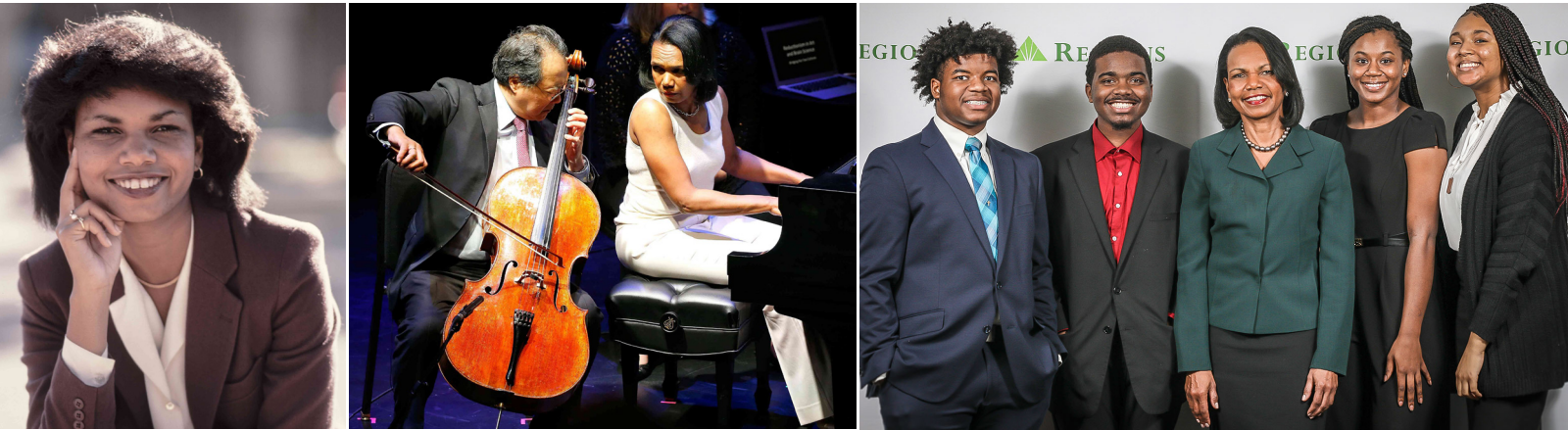
Left: Professor Condoleezza Rice, Stanford University, November 1985.