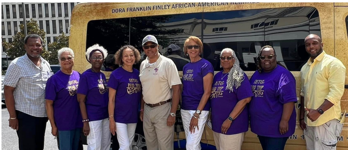
Above: On June 11, 2023, the 60th anniversary of the day Vivian Malone enrolled at the University of Alabama, members of the "Sistas Road Trip" came to Mobile (from all over the the U.S.) to take a trip on the Dora Franklin Finley African American Heritage Tour.